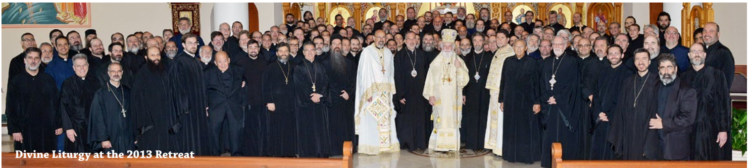
Divine Liturgy at the 2013 Retreat